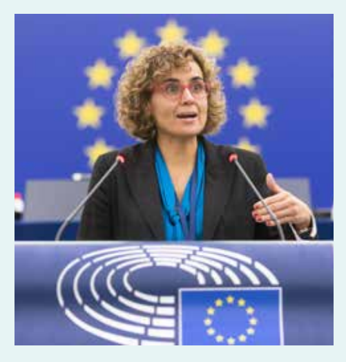
Dolors Montserrat Member of European Parliament and Rapporteur for Report on a pharmaceutical strategy for Europe

ECHAMP was very pleased to see the inclusion of an amendment to the Report on a pharmaceutical strategy for Europe by the European Parliament Committee on the Environment, Public Health and Food Safety (ENVI Committee); this amendment has now been adopted in the final European Parliament report. Point 23 of the report 'Highlights the fact that scientifically recognised integrative medicine approved by public health authorities can bring benefits to patients in relation to the parallel effects of several diseases, such as cancer, and their treatment; stresses the importance of developing a holistic, integrative and patient-centric approach and encouraging, where appropriate, the complementary use of these therapies under the supervision of healthcare professionals.'