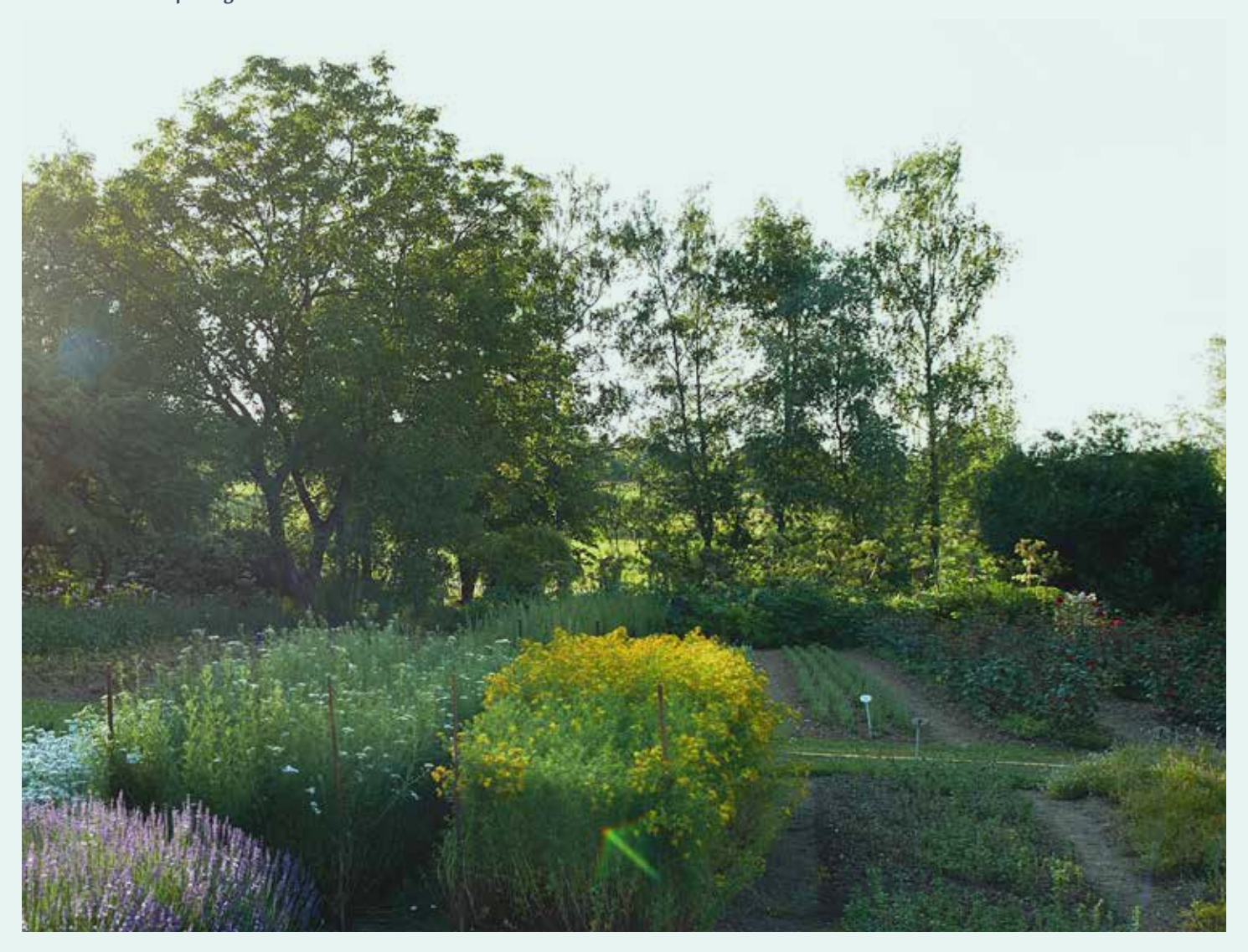
Many ECHAMP members have their own medicinal plant gardens.

It is imperative to review, understand and exploit the contribution our sector can make towards the goal of a greener Europe.